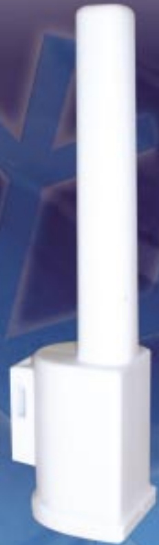
RFID TEMPERATURE TRANSMITTER (TRAILER MOUNTED)