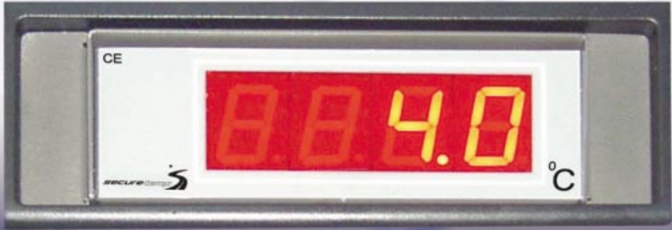
(IN-CAB DISPLAY UNIT)

A reliable and effective temperature monitoring alarm for refrigerated or chilled trailers